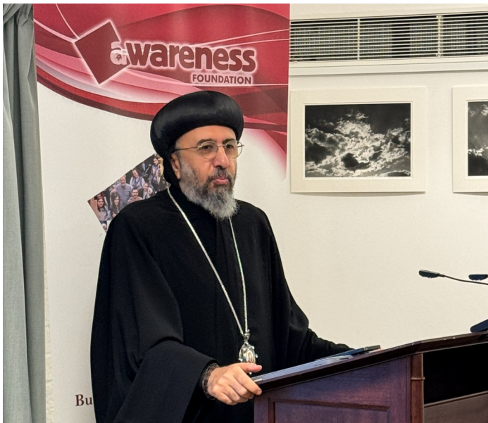
Archbishop Angaelos, Patron

The conference was indeed a gathering of beautiful mixture of peacemakers from East and West and from different faiths and backgrounds in our world city here in London.